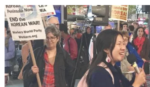
Koreans in U.S. organize 'No Trump Day' November 6, 2017