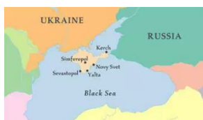
Behind Crimea terror operation: U.S.-NATO escalate war drive against Russia August 30, 2016