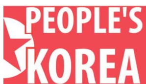
Rochester, N.Y., anti-war groups say no to U.S. threats and sanctions against DPRK September 11, 2017